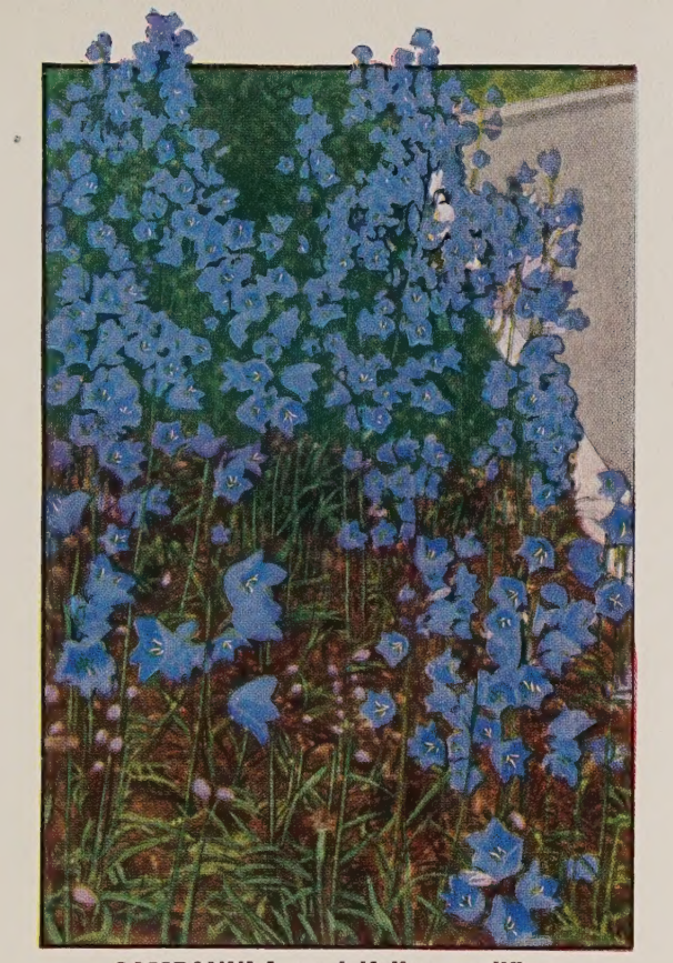
CAMPANULA persicifolia grandiflora

the most valuable and the most showy fall-blooming perennials. Coming as they do just when the other garden flowers are over, Chrysanthemums brighten the dark fall days and bring a promise of another season yet to come. Their culture is very easy. They prefer a good rich soil, which may be obtained by adding a well-balanced commercial fertilizer to any garden soil. The plants are set out in May. Pinching them back in June and again in late July will make them bushy and encourage more bloom. A second feeding of fertilizer in late July is advisable. Great armfuls of flowers for home decoration will be your reward.